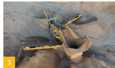
3 Hydraulic, folding side conveyors allow easy transport and set-up times of 10 minutes or less.