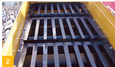
2 High-energy, two-bearing, 16' x 5' screen box, with 157ft² of screening area can sort up to three different product sizes. Optional top deck bofar bars, top deck punch plate, heavy-duty top finger deck and bottom finger deck.