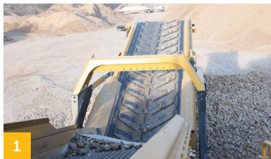
1 A 63" wide discharge conveyor, the widest in the industry, reduces jamming at the screen's discharge point.