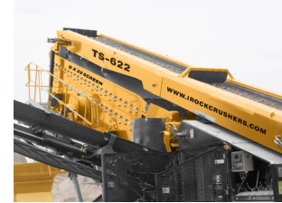
22' x 6' (6710mm x 1830mm) is one of the largest mobile vibratory screening plants in production.