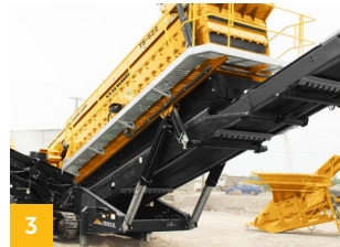
3 Hydraulic Screenbox linkage system, allows greater accessibility for screen change and enables optimum screen coverage at varying screenbox angles.