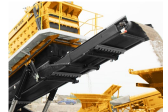
All conveyors are now individually controlled for material flow speed and rollback.