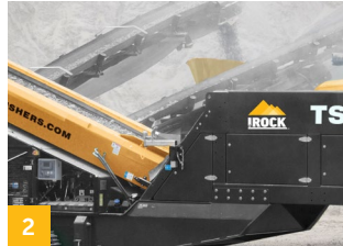
2 Up to 13.1 yd 3 (10m 3 ) high capacity hopper with generous grid opening allows the use of larger loading shovels.