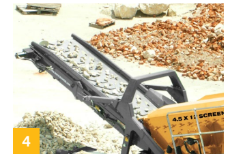
4 Discharging oversize material at 11'-4" (3.45 m), the 48" (1200 mm) wide 3-ply belt allows for efficient stockpiling.