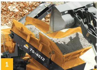
1 7.8 yd 3 (6 m 3 ) hopper equipped with a 48" (1200 mm) heavy duty 4-ply belt designed for heavy duty applications.