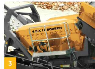
3 4.5' x 12' (1.37 m x 3.66 m) high energy Screenbox with 3/8" throw at 950RPM provides the most aggressive screening action in its class.