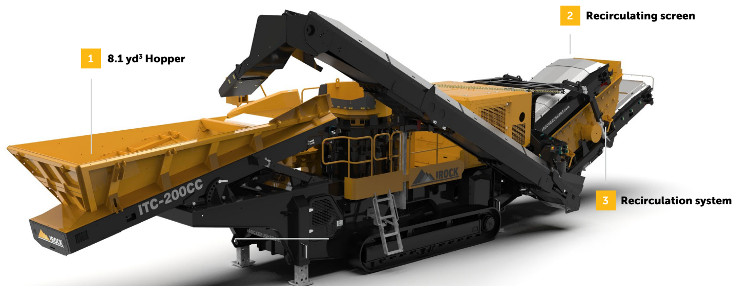
1 8.1 yd 3 Hopper