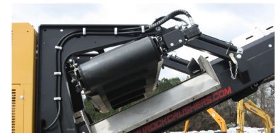
Reversible magnet enables material separation from the source material.