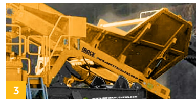
3 Steel hopper with adjustable feed rate via control panel, remote control or fully automatic regulation with feedback from the cone.